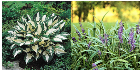
FIRE AND ICE HOSTA GIANT LILY TURF