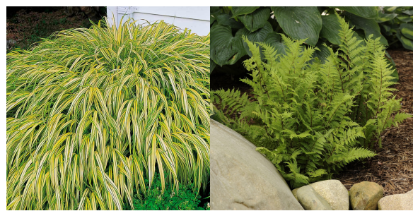
VARIEGATED JAPANESE FOREST GRASS LADY IN RED FERN