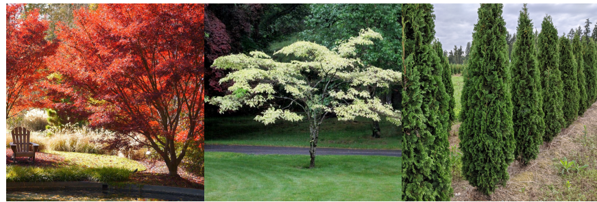
SHERWOOD FLAME JAPANESE MAPLE PAGODA DOGWOOD DEGROOT'S SPIRE CEDAR