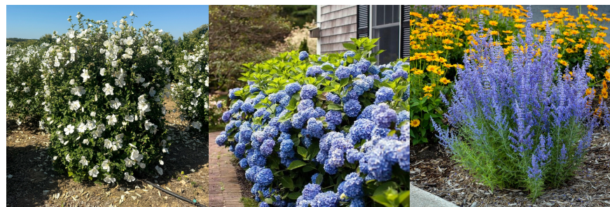
DIANA ROSE OF SHARON ENDLESS SUMMER HYDRANGEA DENIM N LACE RUSSIAN SAGE