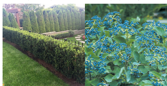
HICK'S YEW BLUE MUFFIN VIBURNUM