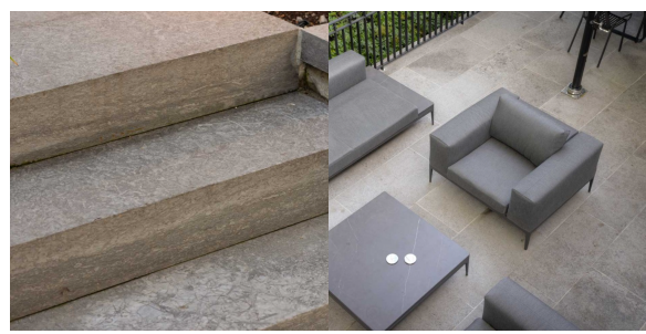
SELECT STONE PLATINUM FLAMED STEP STEPPING STONE