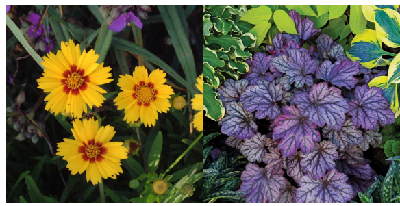
LANCE-LEAVED TICKSEED BLACKBERRY ICE CORAL BELLS