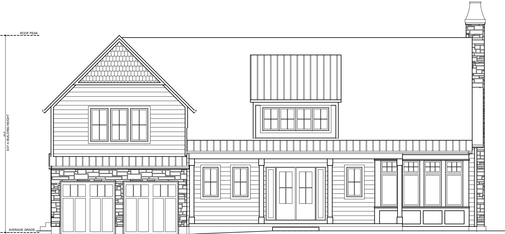
NORTH (FRONT) - GAGE STREET