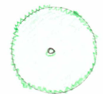
TREE TO BE PRESERVED

NO TREES OWNED BY TOWN NEED TO BE REMOVED.