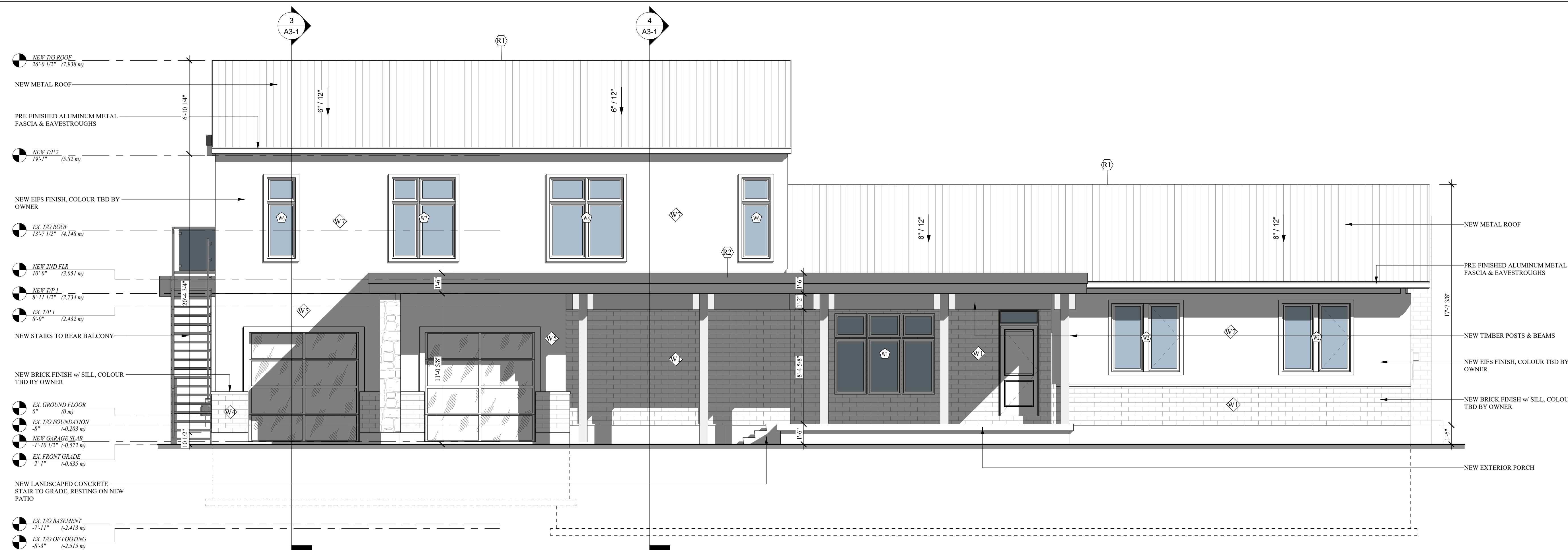
① FRONT ELEVATION Scale: 1/4" = 1'-0"