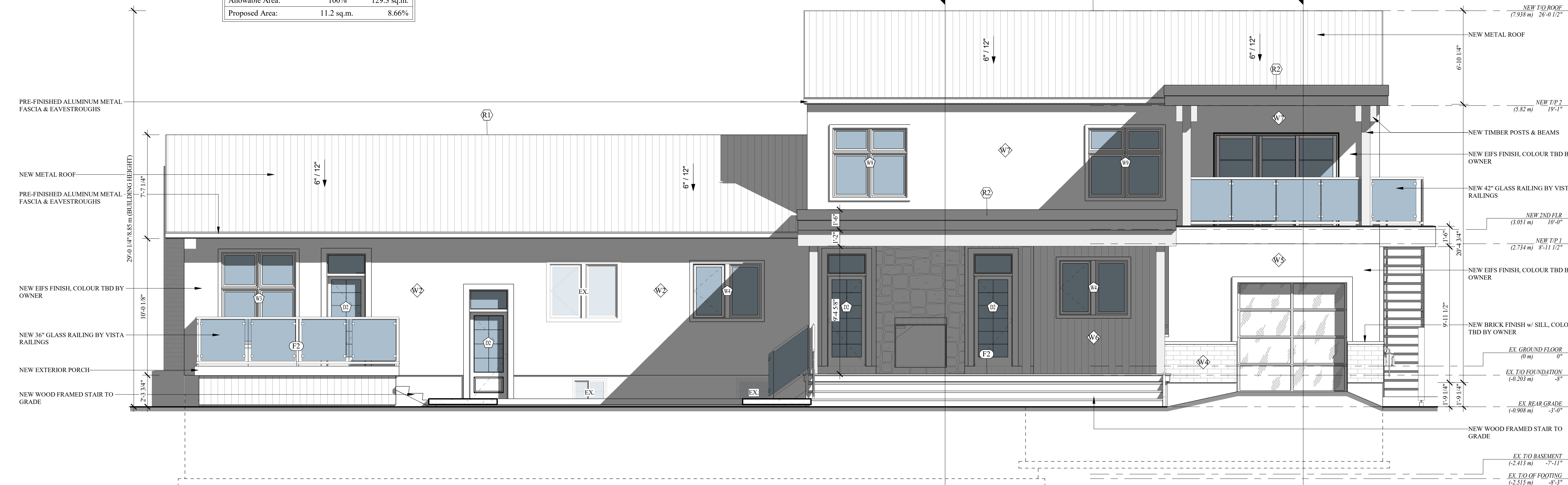
② REAR ELEVATION Scale: 1/4" = 1'-0"