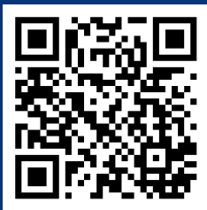
Heritage Planning in Niagara-on-the-Lake