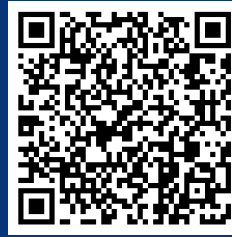
Heritage Permit Application