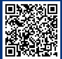
Sign By-law 4586-12 Schedule B