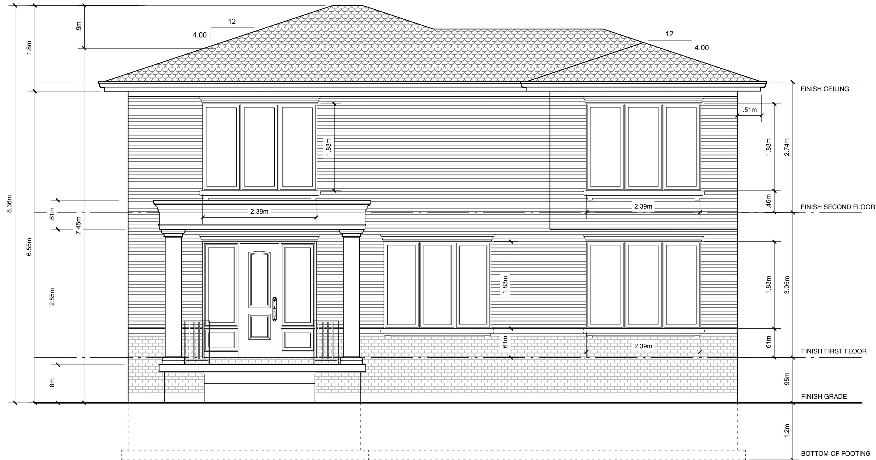
1 FRONT ELEVATION A6 SCALE: 1/4"=1'-0"