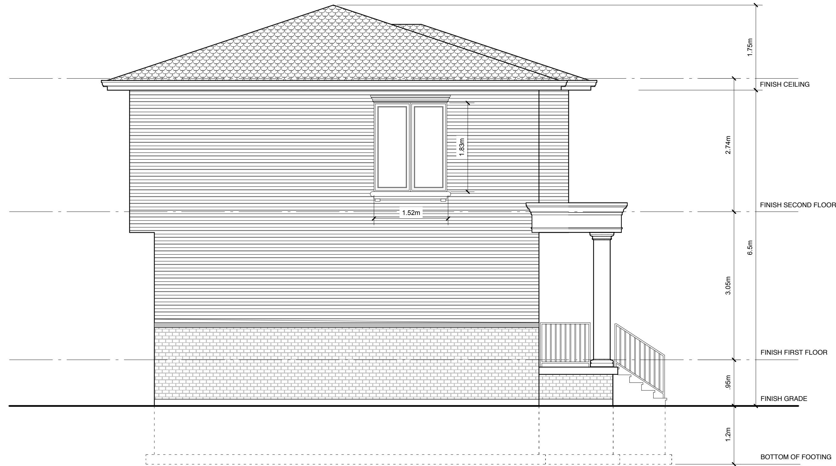
1 LEFT SIDE ELEVATION A8 SCALE: 1/4"=1'-0"